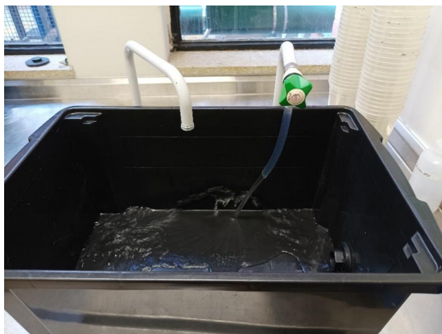
Figure 2: Soaking box