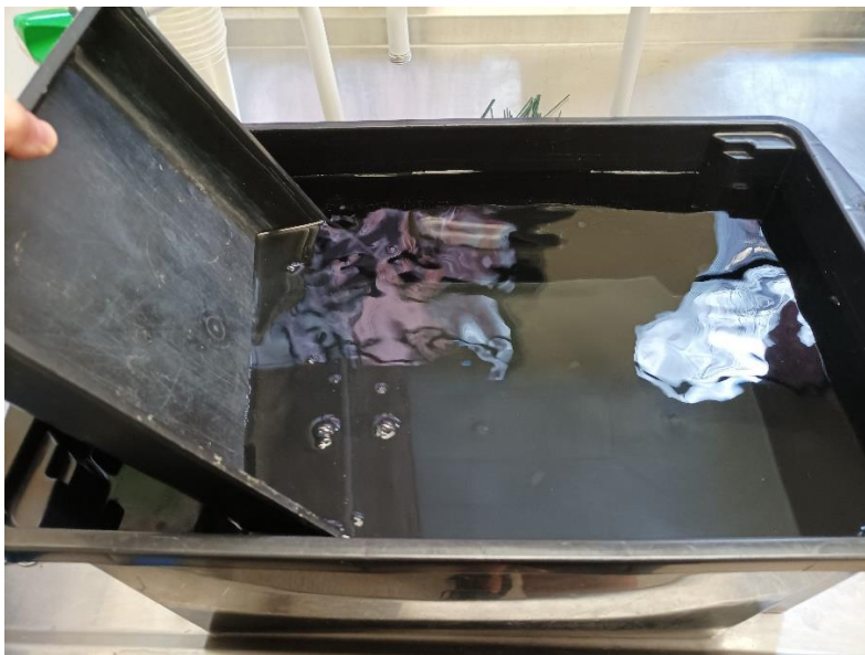
Figure 4: Soaking box with trays