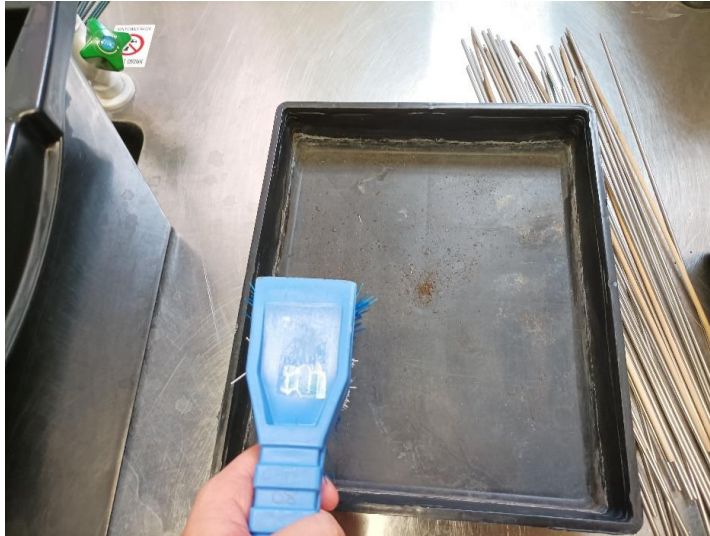
Figure 1: Brush dirty trays until clean